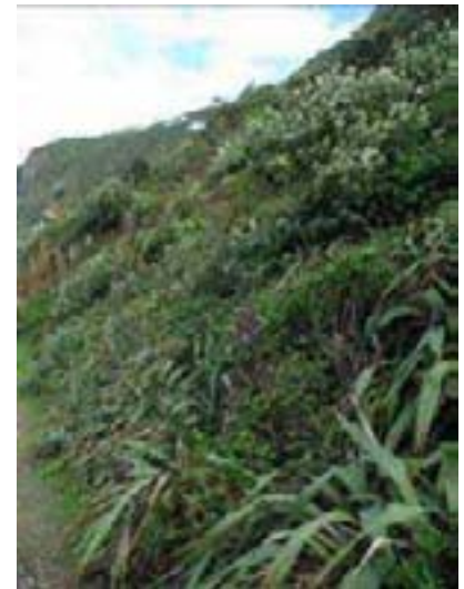
Coastal escarpment, Breaker Bay

The south-facing side (Breaker Bay) has dense regenerating coastal vegetation including wharariki or coastal flax ( Phormium cookianum ) and taupata ( Coprosma repens ). The rocky cliffs at the harbour entrance are sparsely vegetated, in some cases due to erosion but also evidence of the extreme coastal environment. The high winds and salt levels limit what plants will grow at this site. There is a small existing dune containing scattered spinifex or kowhangatara ( Spinifex sericeus ) and pingao ( Ficinia spiralis ) below the cliffs. There are few examples of indigenous dune habitat around the south coast, and most of these are affected by roads and seawalls.