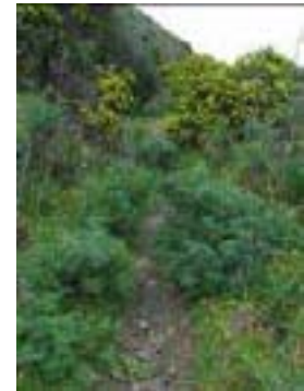
Weeds growing over a track